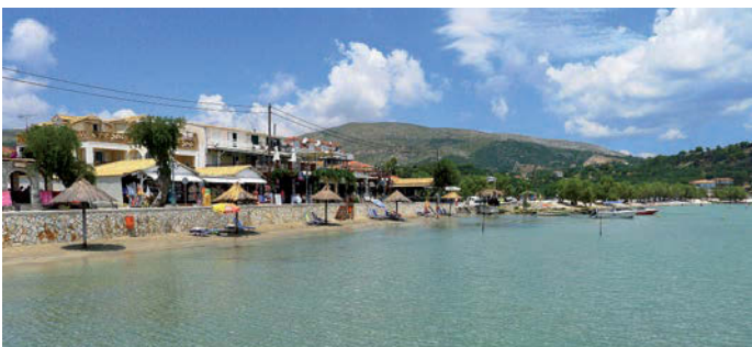
Limni Keri beach